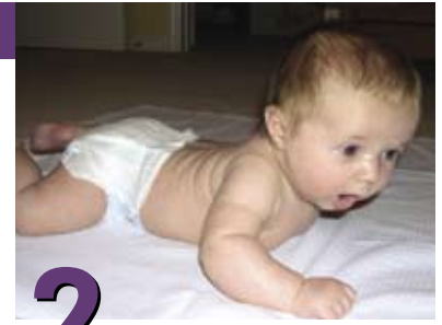
2 More Activities