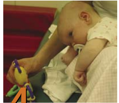
4 Positions for Play