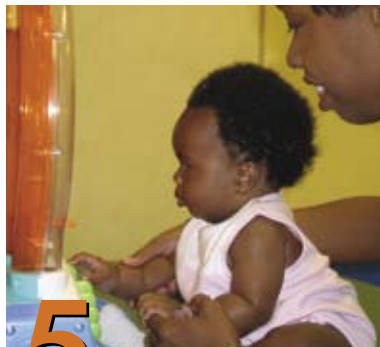
5 Positions for Play