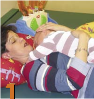
1 Positions for Play