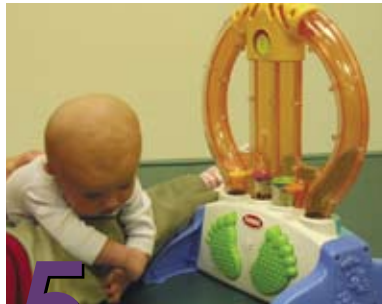
5 More Activities