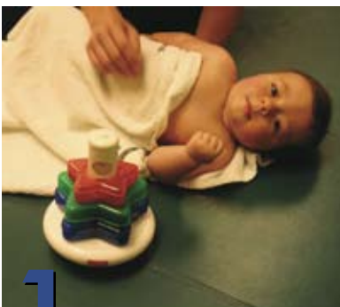
1 Dressing and Bathing