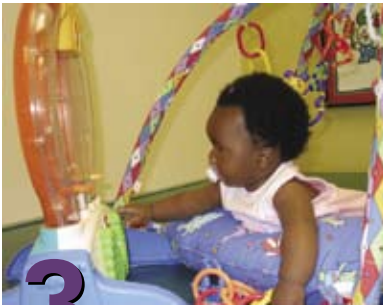
3 More Activities