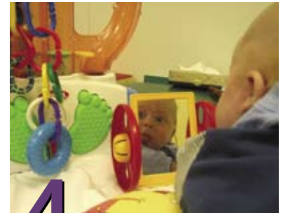
4 More Activities