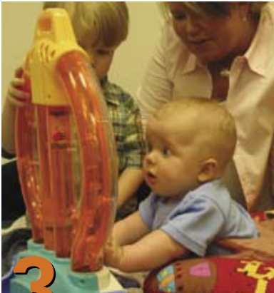
3 Positions for Play