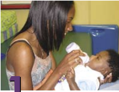
1 More Activities