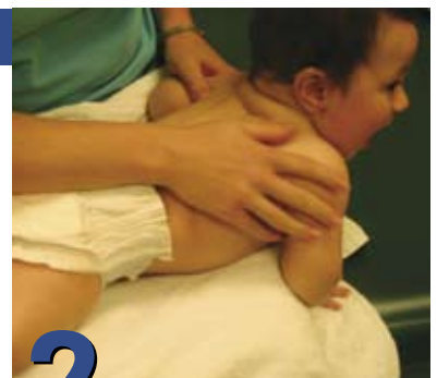
2 Dressing and Bathing