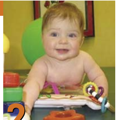
2 Positions for Play